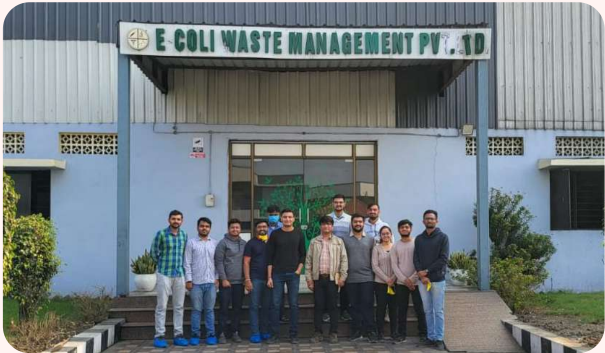
Industrial Visit : E-COLI Waste Management Pvt. Ltd, Ahmedabad, Gujarat