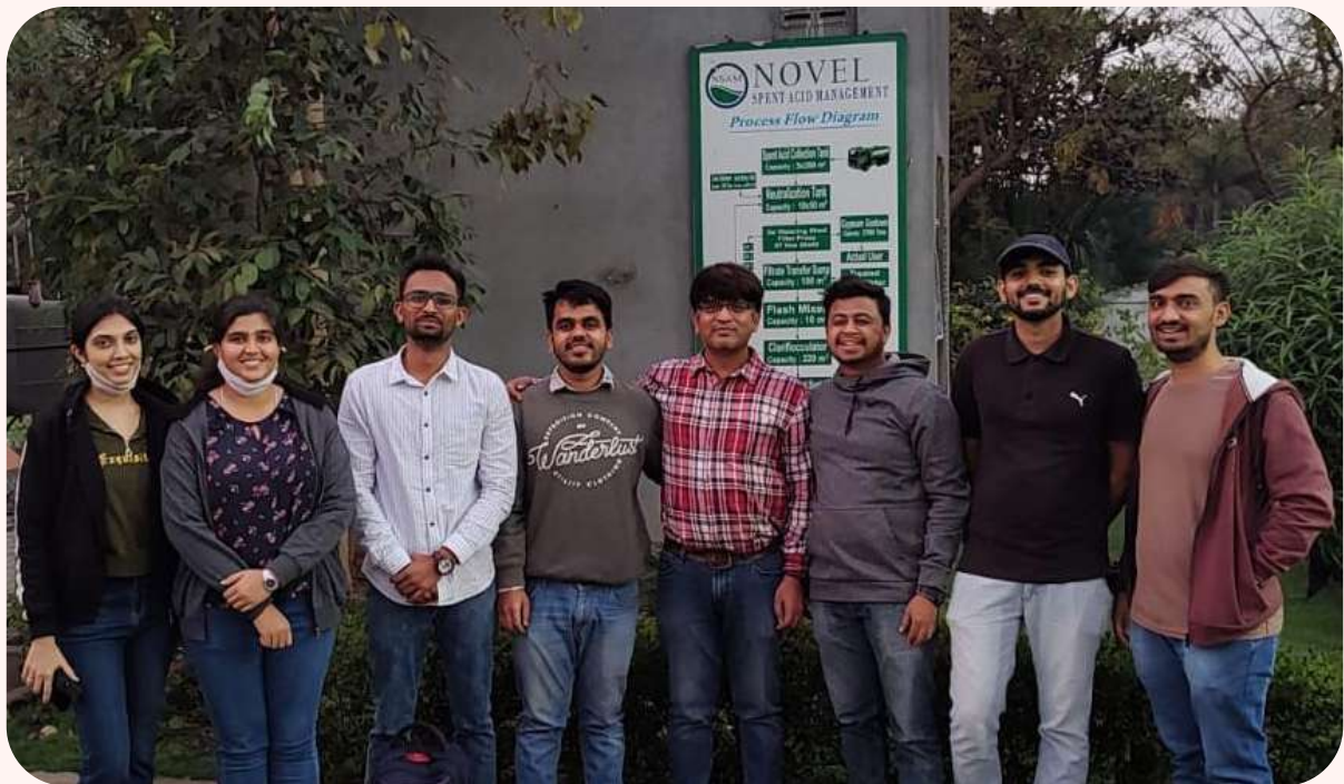
Industrial Visit : NOVEL spent acid Management, Ahmedabad, Gujarat